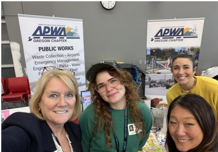
Workforce Development Committee at ASCE E-Week

by Ashely Cantlon, Workforce Development Committee and City of Gresham