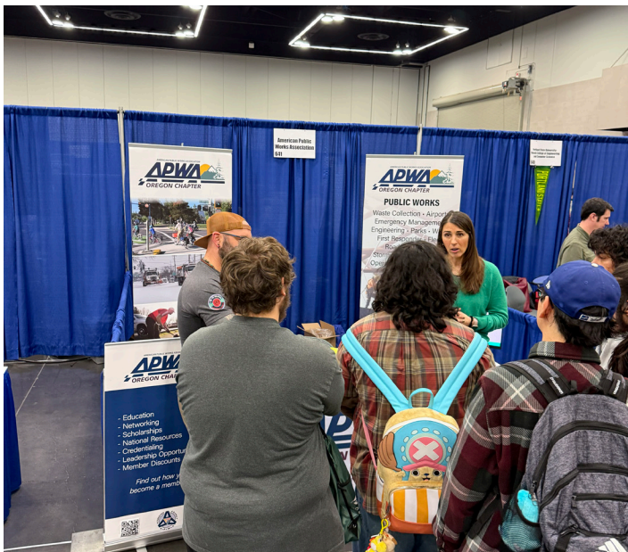
Workforce Development Committee at NSBE Youth Infrastructure Fair

With more people willing and able to attend these events, we can cover more territory and represent APWA to the fullest throughout the state.